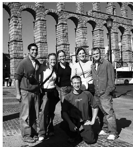
Students in the WIP program, 2005, enjoy a cultural trip to Segovia, near Madrid.