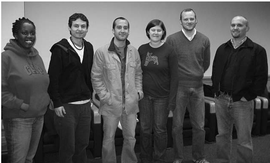
Fuel the body, fuel the brain — A group of graduate students take a lunch break during a long day of MA examinations. It’s a department tradition for fellow graduate students to provide a meal in support of their colleagues’ efforts.