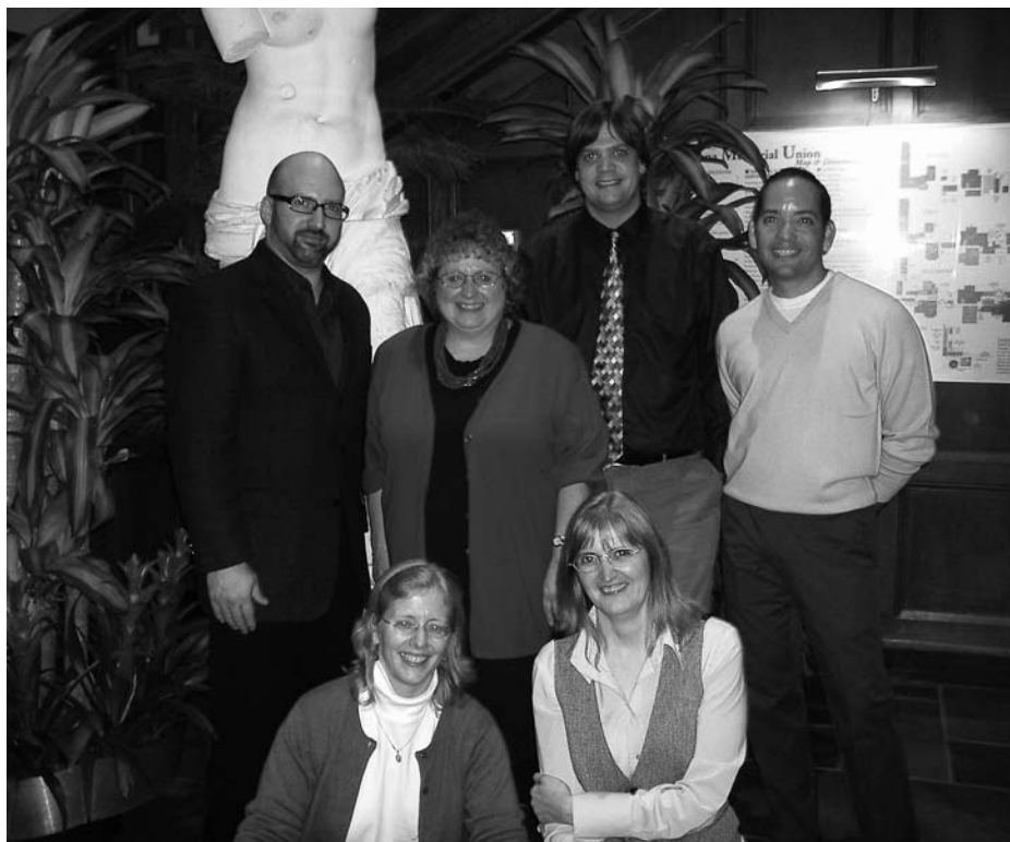
Presenters and organizers at spring “The Other Golden Age” colloquium