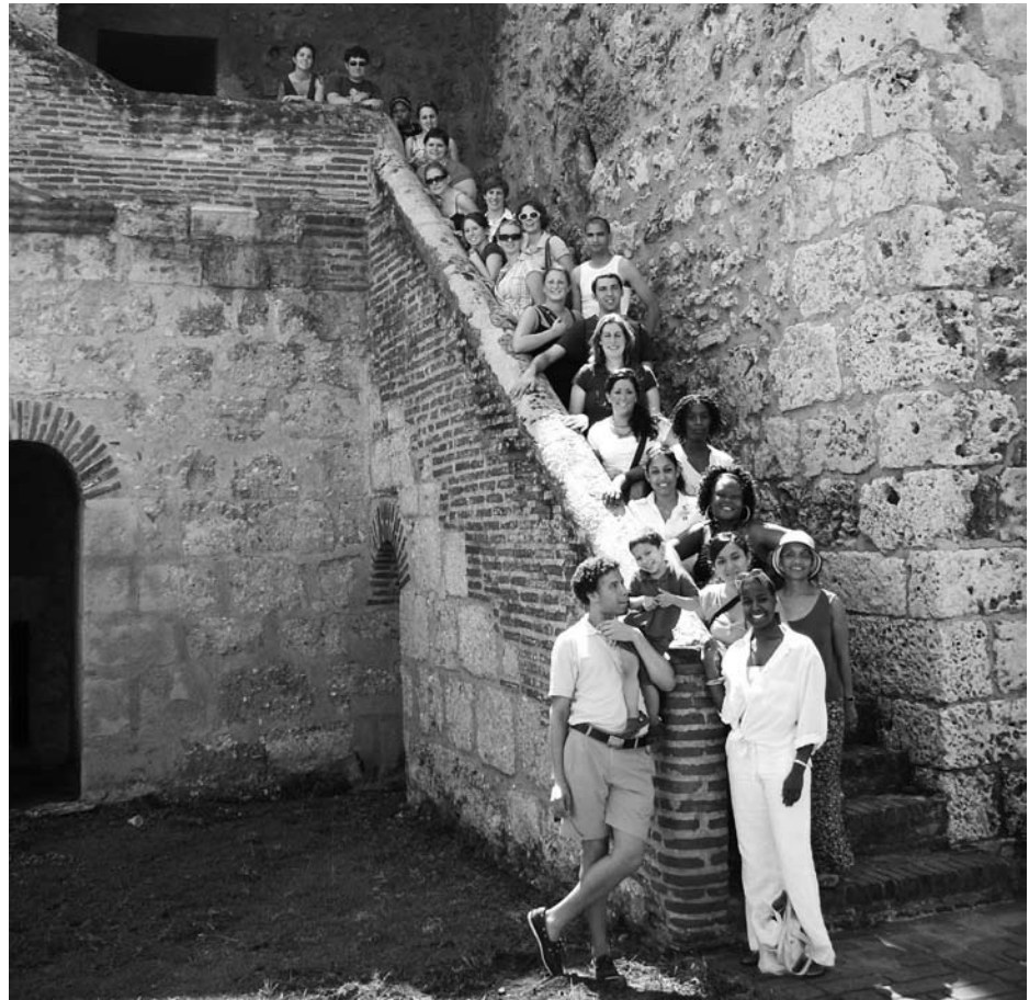
Dominican Identity in the Age of Globalization course participants explore the Fortaleza Ozama, in Santo Domingo's Zona Colonial, during their 2007 summer abroad.

For more about study abroad options, visit www.indiana.edu/~overseas .